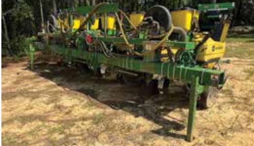
John Deere 1700