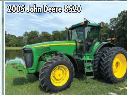
2005 John Deere 8520