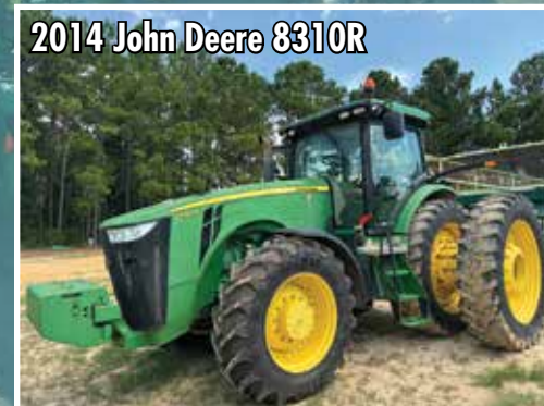
2014 John Deere 8310R