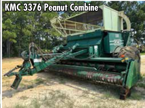
KMC 3376 Peanut Combine

Friday, August 16th • 8:30 am HWY 84 W (6 mi. East of Donalsonville, GA), Iron City, GA IRON CITY, GA