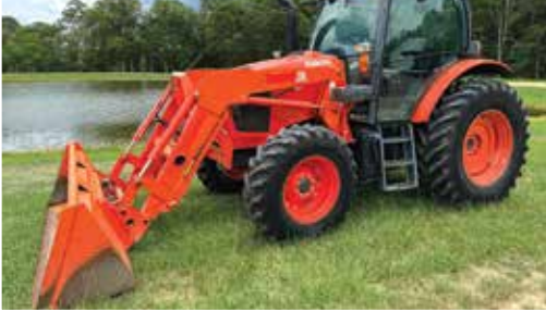
2015 Kubota M6-111