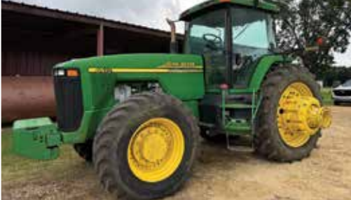
John Deere 8410