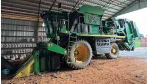
John Deere 7760 Round Bale Cotton Picker