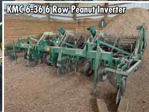
KMC 6-36 6 Row Peanut Inverter