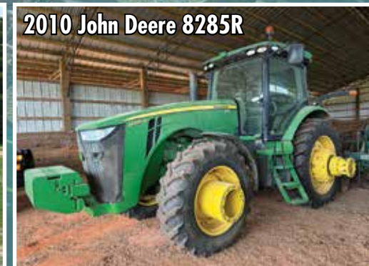
2010 John Deere 8285R