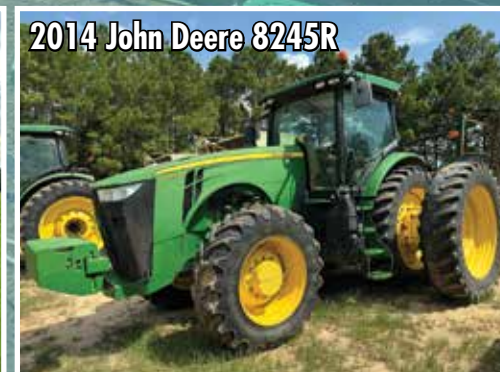
2014 John Deere 8245R