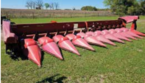
Case IH 2412 12 Row Corn Head