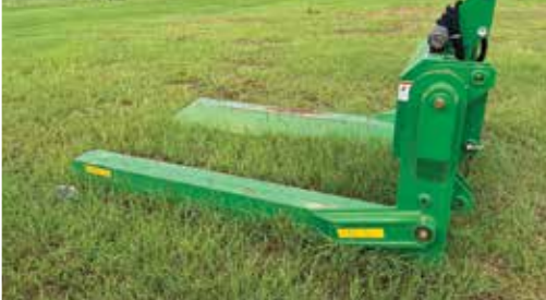
Frontier CM11 Cotton Module Handler