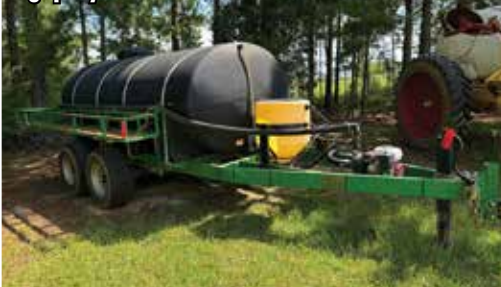
AgSpray 1635 Nurse Tank