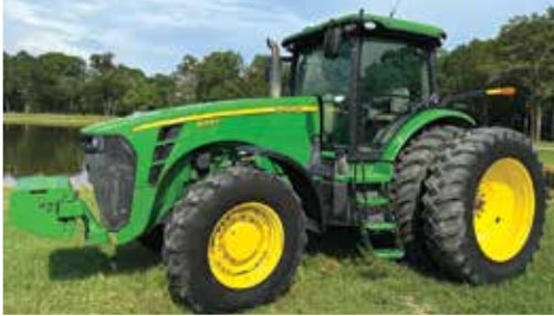
2010 John Deere 8295R