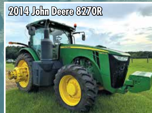
2014 John Deere 8270R