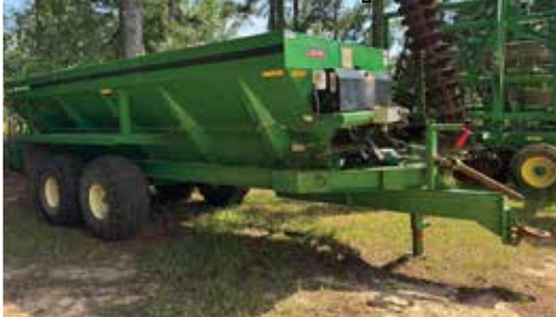
Salford BBI Endurance Litter Spreader