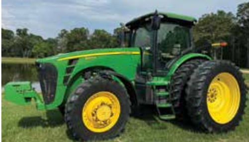
2012 John Deere 8345R