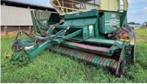
KMC 3376 Peanut Combine