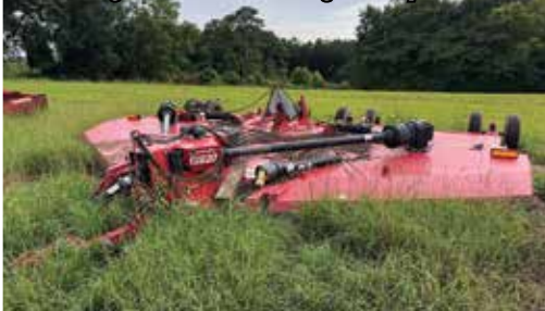
Bush Hog 12820 Flex-Wing Rotary Cutter