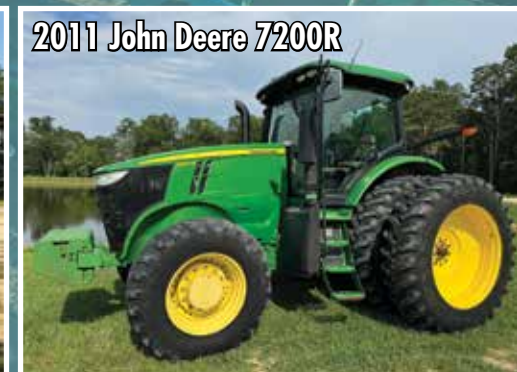
2011 John Deere 7200R