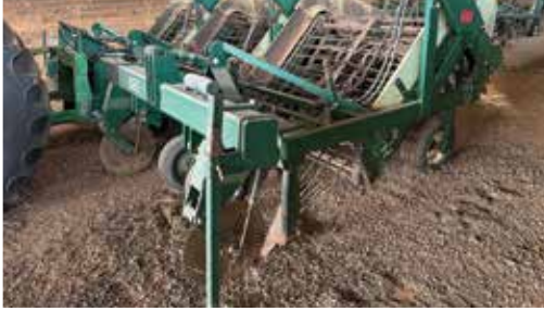
KMC 6-36 6 Row Peanut Inverter