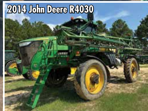
2014 John Deere R4030