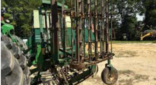
KMC 6 Row Re-Shaker