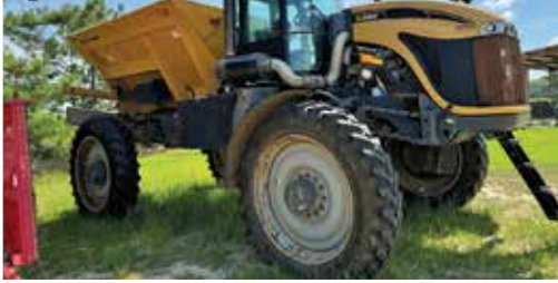
Rogator RG900 w/ New Leader L4258G4 Spreader