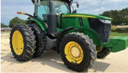
2016 John Deere 7210R