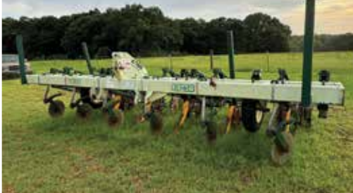
KMC 6700 Rip Strip